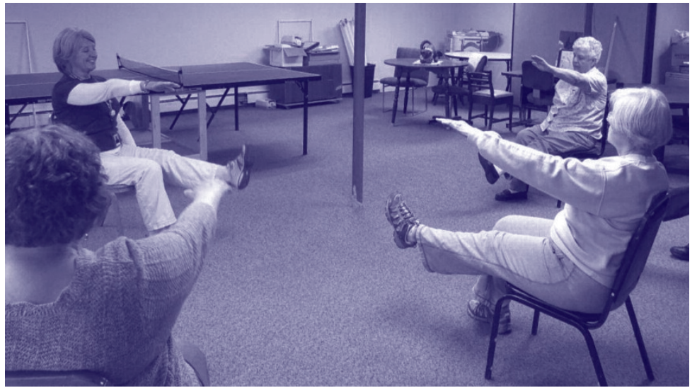
Chair Yoga classes are offered at the Charlevoix Senior Center on Tuesday

A series of poses are used to increase flexibility and strength. After stretching, strengthening and breathing through chair poses, your body and mind can experience a release of stress and tension. A great way to start (or end) your day!