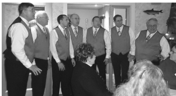
East Jordan's Harmony Hunters entertained the crowd at the East Jordan Area Chamber of Commerce Holiday Business after Hours last Thursday. The event was hosted at A Matter of Taste at Tapawingo in Ellsworth and sponsored by Charlevoix State Bank and E.J. Area business people made donations to the Care & Share Food Pantry and the Good Samaritan. Their generosity will help many families this holiday season.