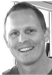
By Jamie Woodall