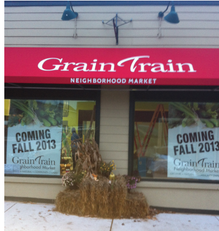
The Grain Train is preparing their new location in Boyne City to open soon.

PO Box 205, Boyne City, MI 49712 • www.CharlevoixCountyNews.com • (989) 732-8160 • Office@CharlevoixCountyNews.com