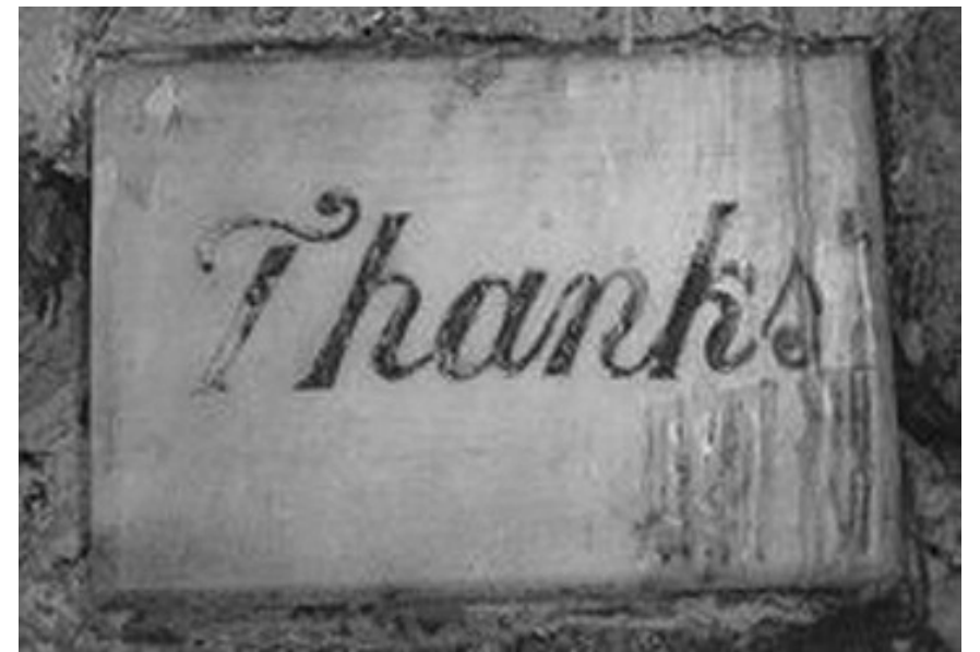
Secret2Photo; Sign in the grotto of Our Lady of Guadalupe Church. WIKIPEDIA COMMONS PHOTO

So, how do we shift our thinking to create what we want instead of dwelling on what we don't want? One way to become more positive in your thinking is to stop thinking about what is lacking in your life is to recognize all the wonderful things already in your life. It is easy to fall into the habit of thinking that our lives would be better if we could only get the right job or the right mate. By thinking that way, we are focused on what we don't have and that negativity is not going to attract the job or the