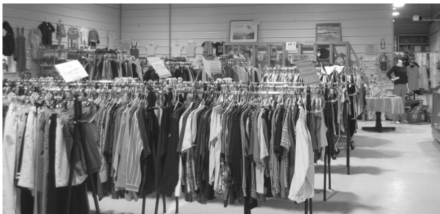
The Bergmann Center Resale Shop offers terrific bargains on resale goods ranging from clothing, furniture and other household items, to one-of-a-kind new products created by local individuals.

What many may not be aware of is that starting in August of 2010, The Bergmann Center opened a fantastic Resale Shop located right next to their main facility on Ance Road, offering terrific bargains on resale goods ranging from clothing, furni-